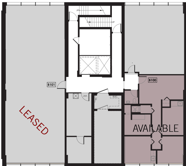
BASEMENT SUITE B101 - 793 SQ FT